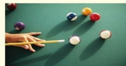
Billiards/ Pool (U.S.)